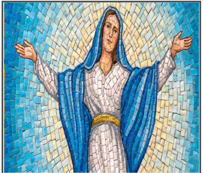
THE ASSUMPTION OF THE BLESSED VIRGIN MARY